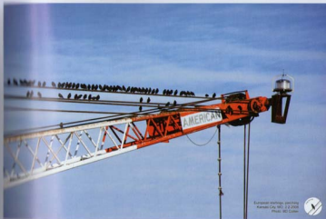
(1) Collier, Kansas City Adult European Starlings, Perching, 2008, archival digital print, 13" x 19".