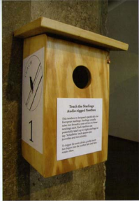
Installation views of Teach the Starlings in Kansas City (left to right): Map of North America painted on gallery wall showing the spread of starlings since their introduction and the site of other starling leaching projects; detail of local Kansas City-area map with black and white pins marking starling sightings and nest sites; BD Collier motion-activated nest box that says "Schieffelin."

faculty position with the Kansas City Art Institute. He prefers to "work where he lives" and considers Teach the Starlings the beginnings of his relationship with the city. The Paragraph gallery, located downtown, served appropriately as a base for this operation. A large map in Paragraph documented the historical spread of the starling across North America, pinpointing locations of other Teach the Starlings events. An inset of downtown Kansas City was marked with black-and-white straight-pins, the former denoting sightings, the latter roosts and nests. Projected video footage of flocks of starlings, also known as murmurations, in the Kansas City area occupied the south, dimly lit wall of the space. In a nearby corner, an informative DVD explained starling history, behavior, and how to participate in the project.