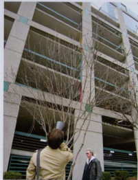
Teach the Starlings walking tour (left to right). Collier calls to a few starlings out in the trees along Grand Boulevard near 13th Street; pellets of orange bird food are coloring sidewalk planters along Grand Boulevard to attract starlings from their roosts; a parking building on the 1300-block of Wyandotte seen from the south has anti-bird screening that keeps out pigeons but provides an urban habitat for starlings.